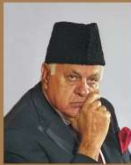
Chief Guest – Valedictory Session Dr Farooq Abdullah Hon'ble Minister for New and Renewable Energy Ministry of New & Renewable Energy Government of India