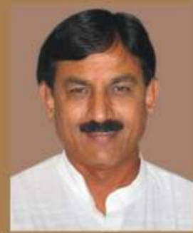
Shri Bharatsinh Solanki Hon'ble Minister of State for Power, Ministry of Power Government of India