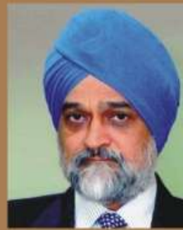
Shri Montek Singh Ahluwalia Deputy Chairman Planning Commission Government of India