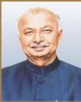
Chief Guest – Inaugural Session Shri Sushilkumar Shinde Hon'ble Minister for Power Ministry of Power Government of India